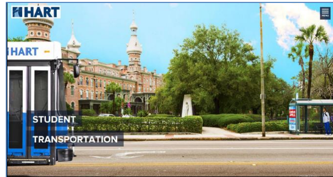
University of Tampa