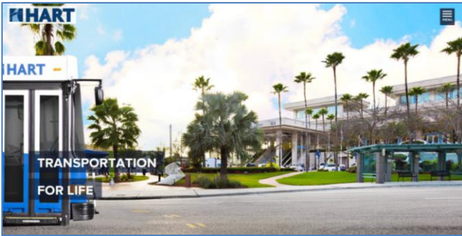
Tampa Convention Center